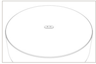
LOCATION FOR 30", 36" & 42" ROUND/OVAL TABLES